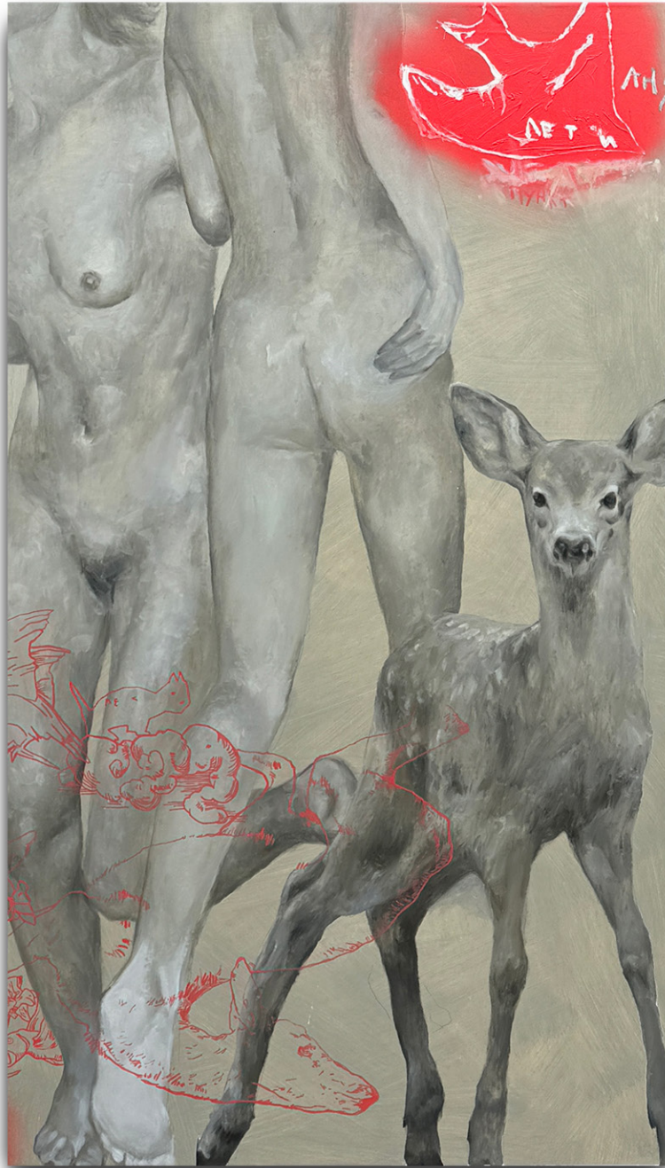
Anna Veriki, My Freedom, 2023 Oil on canvas, 78 3/10 × 45 7/10 in (199 × 116 cm) $ 5 000