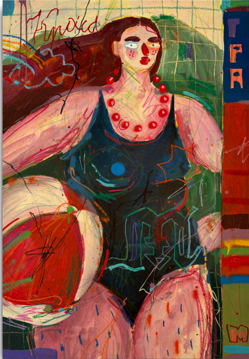
Iryna Maksymova, It's a Game , 2022 Acrylic, pastels, spray, markers on canvas, 27 1/2 x 38 5/8 in (70 x 98 cm) $ 3 900