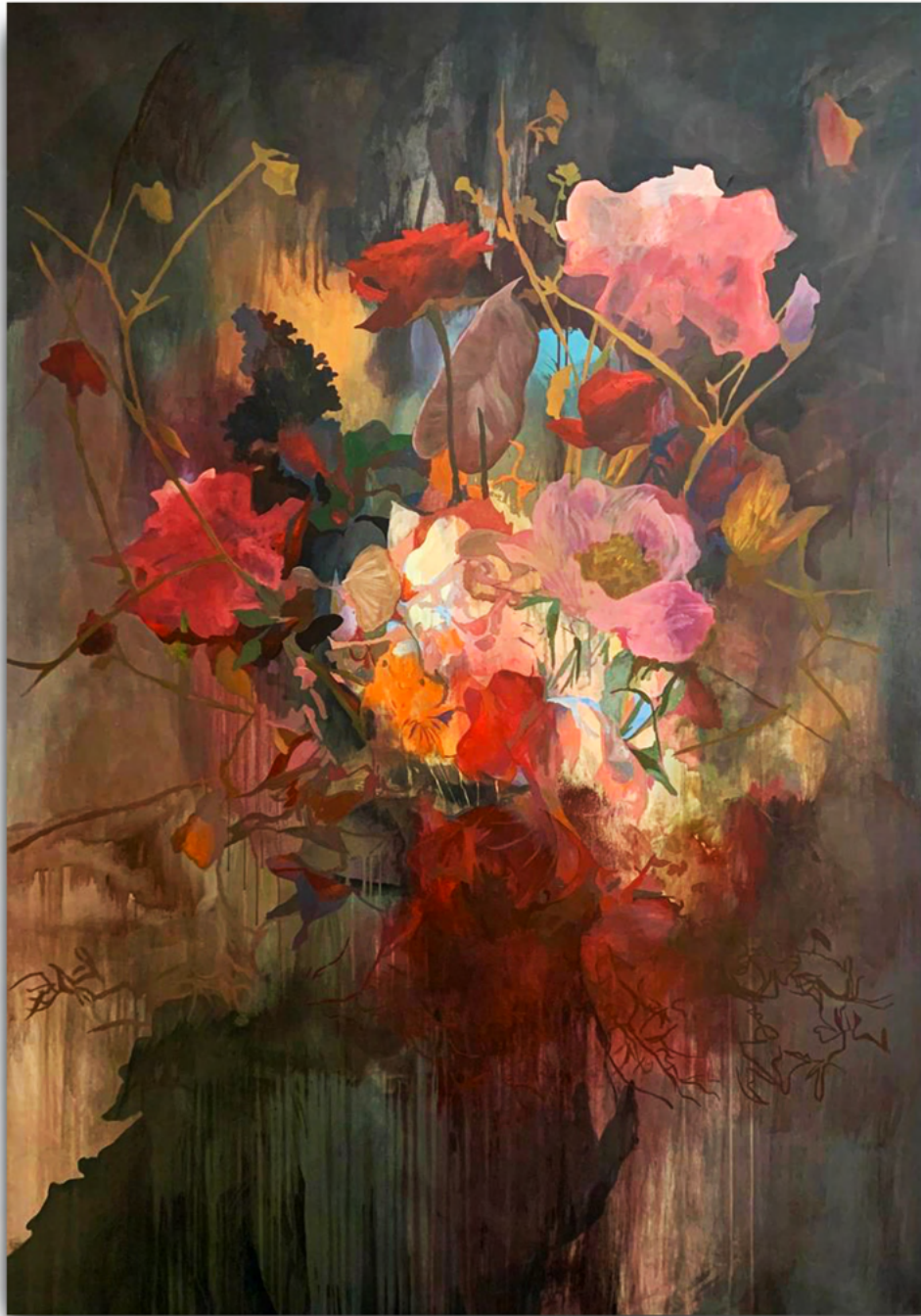
Liza Zhdanova, Flowers, 2024 Acrylic on canvas, 78 x 55 in (200 x 140 cm) $ 9 000