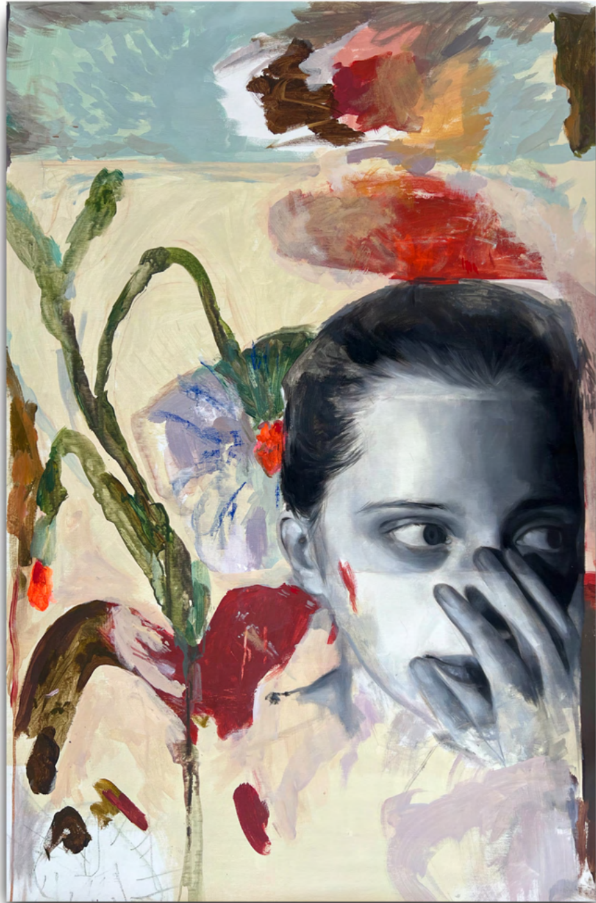
Inna Kharchuk, Florescence, 2024 Acrylic and oil on canvas, 47 x 31 in (120 x 80 cm) $ 3 000