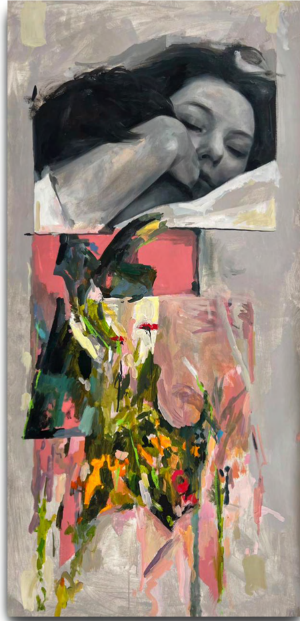
Inna Kharchuk, Levada/Home, 2024 Acrylic, oil and pastel on canvas, 53 x 20 in (135 x 60 cm) $ 3 000