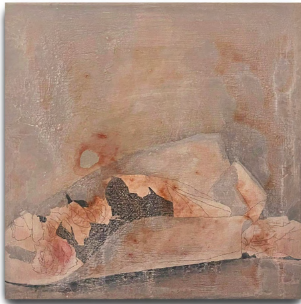
Liza Zhdanova, No name, 2022 Acrylic on canvas, 13 1/2 x 13 1/2 in (35 x 35 cm) $ 800