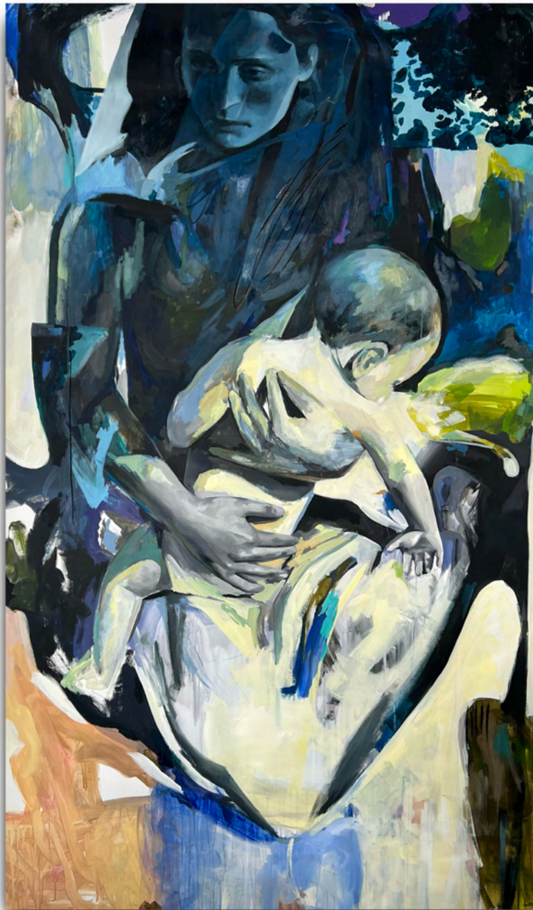
Inna Kharchuk, Dependence 1, 2023 Acrylic and oil on canvas, 76 4/5 × 44 9/10 in (195 × 114 cm) $ 7 000