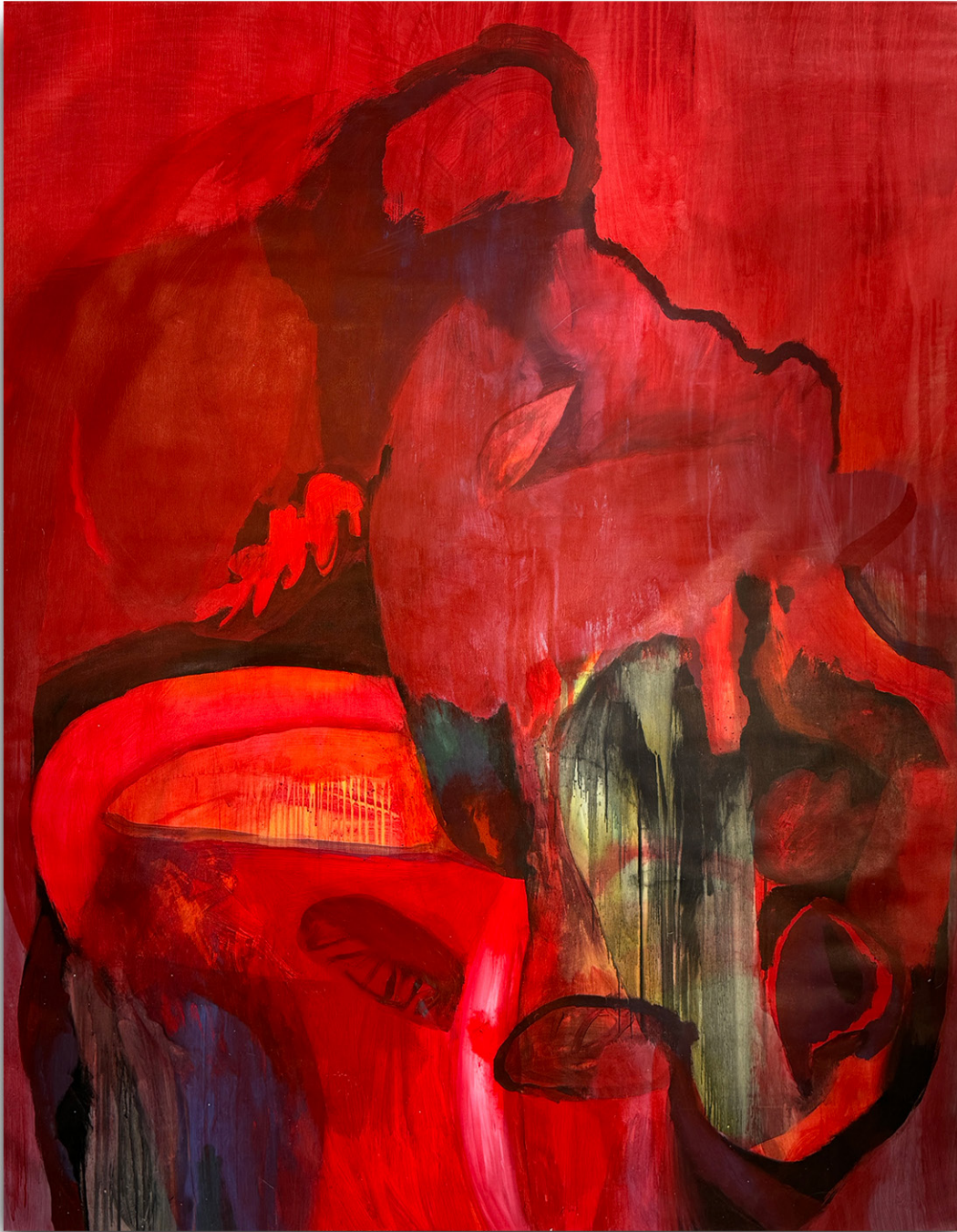
Liza Zhdanova, No name, 2020 Acrylic on canvas, 78 x 60 in (200 x 150 cm) $ 5 000