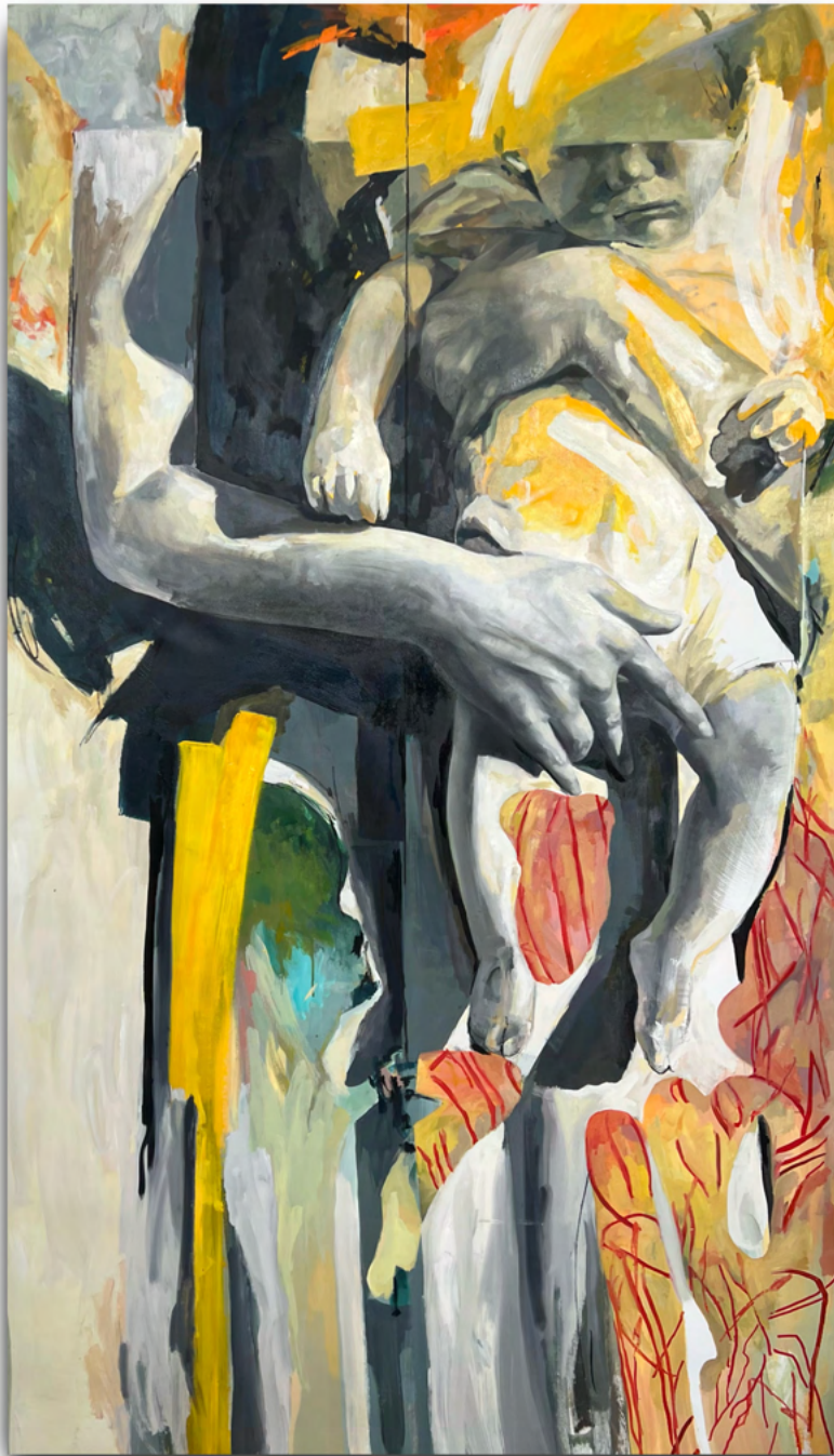
Inna Kharchuk, Dependence 2, 2023 Acrylic and oil on canvas, 76 4/5 × 44 9/10 in (195 × 114 cm) $ 7 000