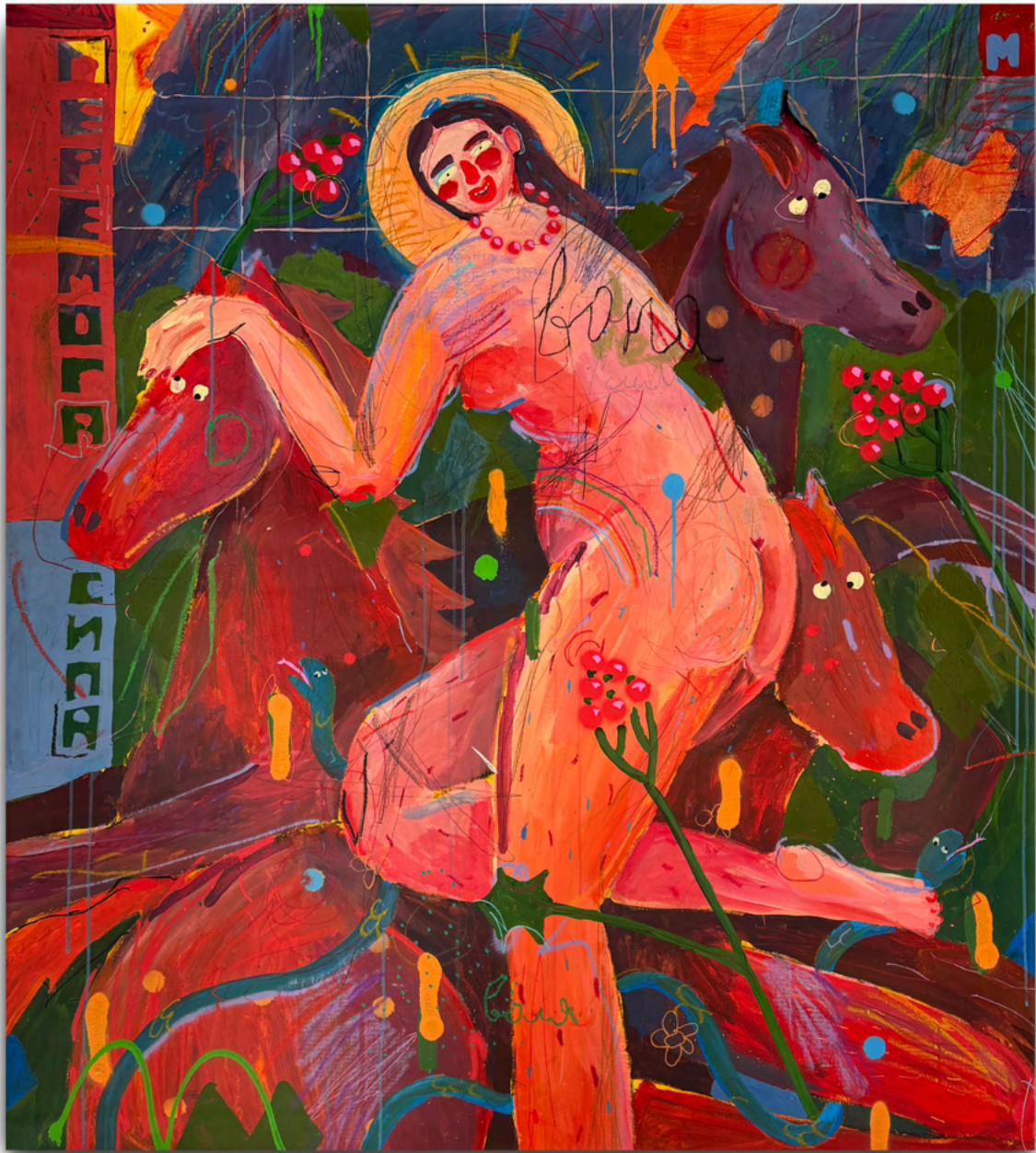
Iryna Maksymova, Caring for Each Other , 2022 Acrylic, pastels, spray, markers on canvas, 53 1/8 x 59 7/8 in (135 x 152 cm) $ 6 800