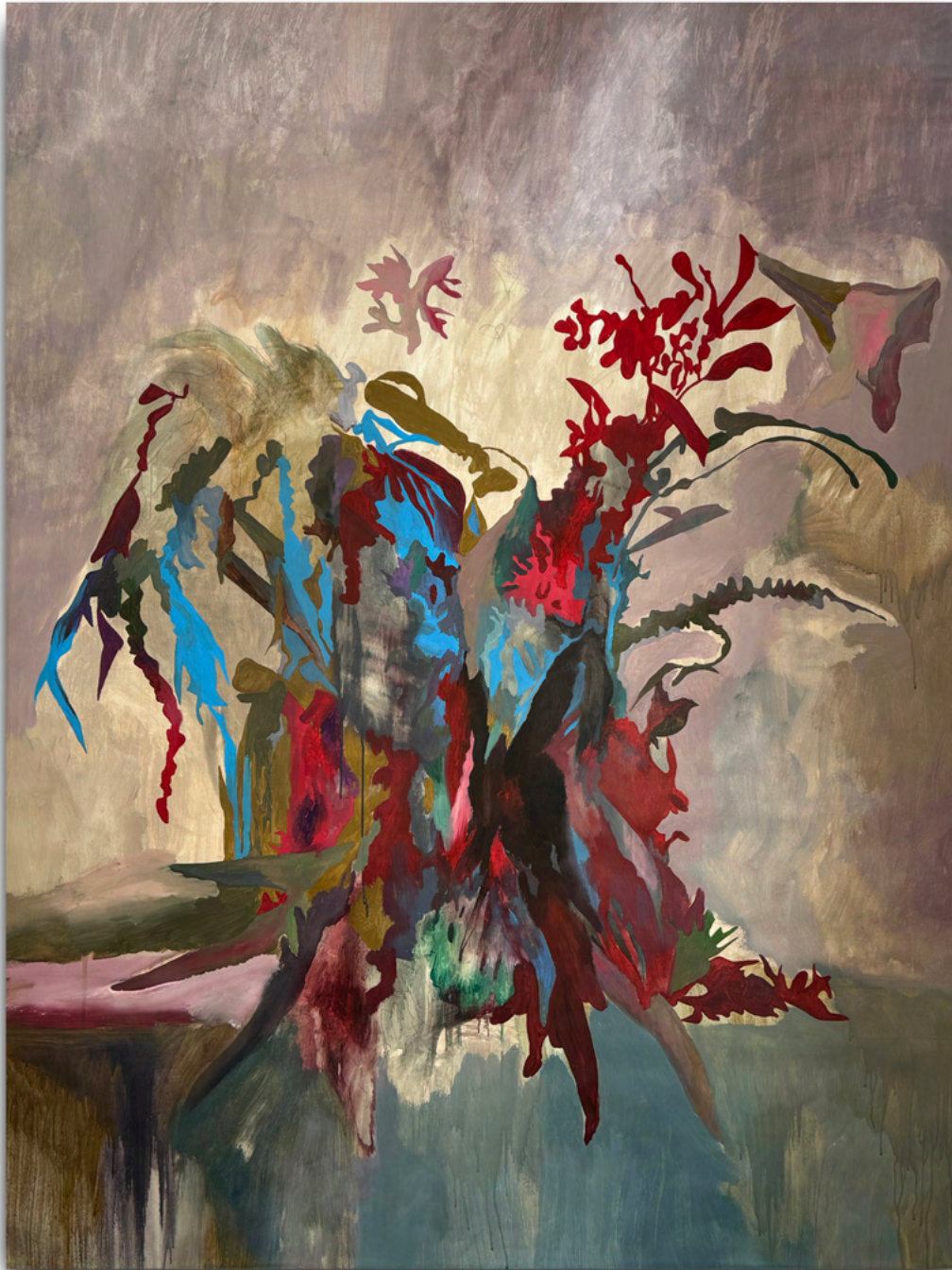
Liza Zhdanova, Flowers, 2023 Acrylic on canvas, 78 x 60 in (200 x 150 cm) $ 7 000